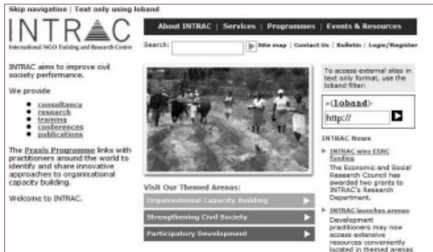
see article on page 5

So in what ways are the MDGs different? The MDGs on the face of it at least appear to be a nice, simple way for civil servants and politicians to work: they set out quite narrow goals, which seem on