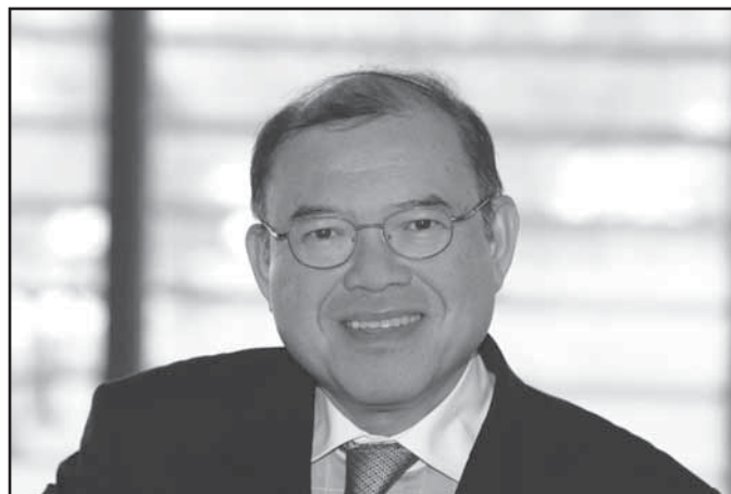
Interview with UNCTAD Secretary-General Supachai Panitchpakdi Follow-up to UNCTAD XII: The Way Forward

UNCTAD had demonstrated its ahead-of-the-curve thinking and objectivity in its predictions in relation to the recent crises. Participants called for the strategies advocated in the Trade and Development Report , policy briefs and other UNCTAD publications to be translated into practical solutions and incorporated in international, regional and national policies. Civil society was encouraged to provide feedback on UNCTAD's work and to identify the areas in which UNCTAD should be engaged. It was suggested that UNCTAD should conduct an analysis of rating agencies and assess their role in developments in the financial markets. Several participants called on UNCTAD to support initiatives to introduce financial governance at the global level. Some participants called on UNCTAD to play an active role in convening an international conference to review the international financial and monetary architecture and global economic governance structures. It was suggested that such a conference would allow UNCTAD to assess the impacts of financial crises on developing countries and propose mitigation strategies.